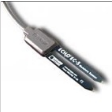
Figure 4: Buried soil moisture sensor

We will install three sets of nested soil moisture probes at depths of 10, 25, and 50-cm below the ground surface. Each sensor nest will require that we auger a 6-inch diameter hole to a total depth of about 60-cm to install the sensors, which will be backfilled with in-situ material and vegetation replanted. Each soil moisture nest will be supported by a small datalogger (the same as pictured in Figure 3) mounted just above the ground surface on a very short PCV or metal standpipe. The data logger and standpipe will be painted green and brown to minimize visual disturbance to the landscape.