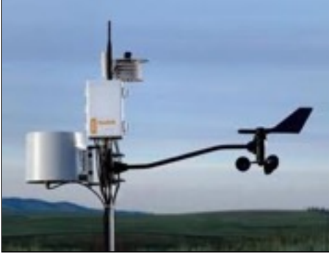
Figure 3: Proposed Decagon Microclimate monitoring system. For scale, the datalogger (white box) is 5-in wide by 8-in tall.

We propose to install a small meteorological station at the site in the open area between the middle and northern ponds. This station will monitor a suite of environmental variables, and will allow us to monitor precipitation inputs to and estimate evapotranspiration outputs from the site. The system will be mounted on a semi-permanent fence post or small diameter steel pipe driven into the ground.