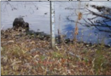
Figure 1: Sample staff gauge, representative of installation proposed

Additionally, we will install an instructional sign mounted on a 4x4 wooden post adjacent to the staff gauge on the shoreline of the water body. This signage would explain why we are monitoring water level, and ask guests to read the staff gauge (with instructions provided) and text that water level to our database. The data will be housed on www.crowdhydrology.org and will be freely available for public viewing. We view this as an opportunity to engage the public in the management of this resource, and to aid our monitoring efforts.