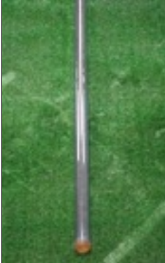
Figure 5: Soil moisture monitoring tube

We propose to install 20-40 small diameter (approximately 1-in) PVC tubes in the shallow subsurface of the site, in and around the middle pond. Tubes will be entirely subsurface (not protruding above the landscape), and will be capped both top and bottom. These access tubes allow us to make manual measurements of soil moisture to compliment the logger network proposed above.